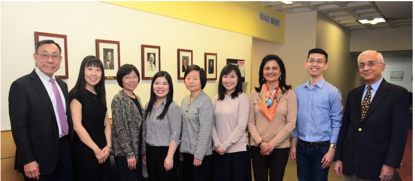
Research – Clinic – Education – Outreach - Advocacy